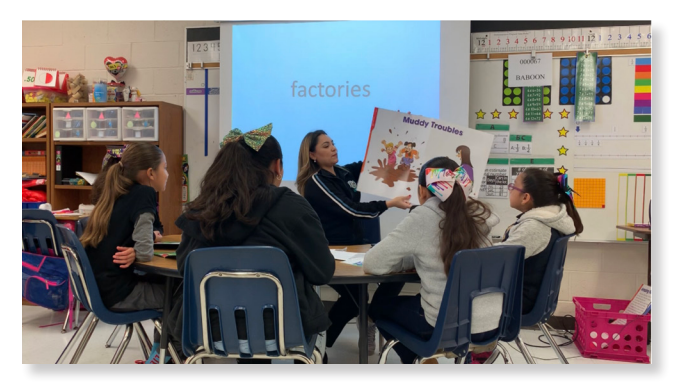
Figure 2. Project ELLIPSES Classroom

In this vignette, a Project ELLIPSES teacher provides evidence-based reading intervention to fourth-grade ELs.