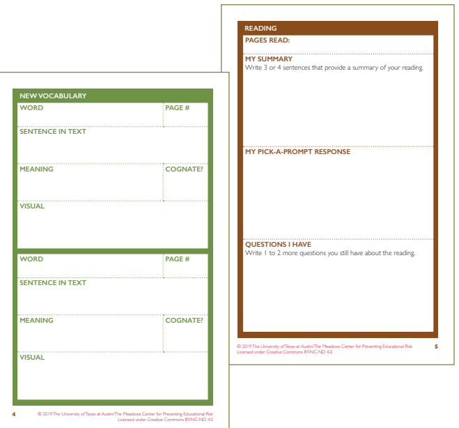
Figure 3. Sample pages from Project ELITE<sup>2</sup> Text Talks Workbook

Evidence-Based Tier 2 Intervention Practices for English Learners © 2020 U.S. Office of Special Education Programs